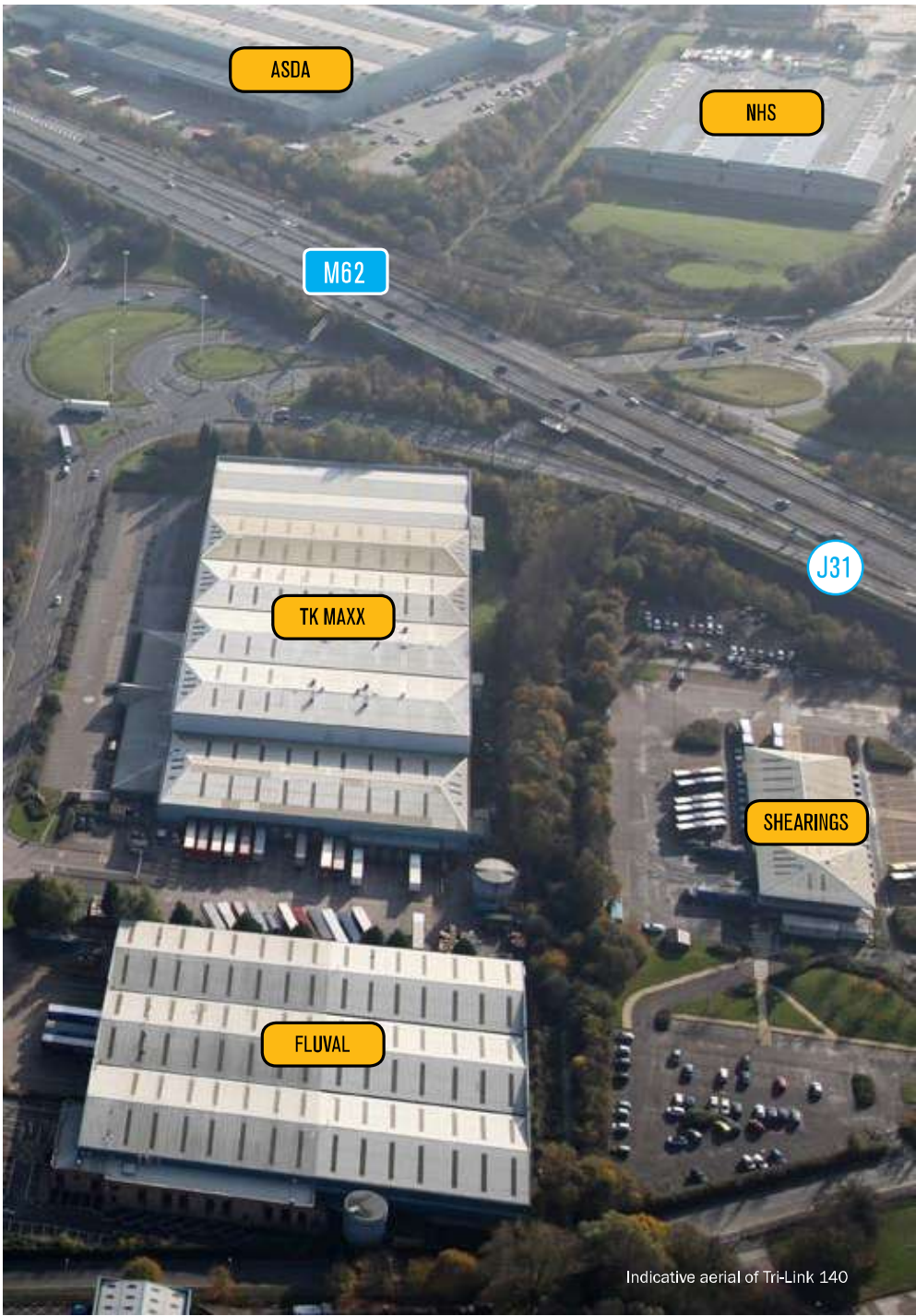
Indicative aerial of Tri-Link 140